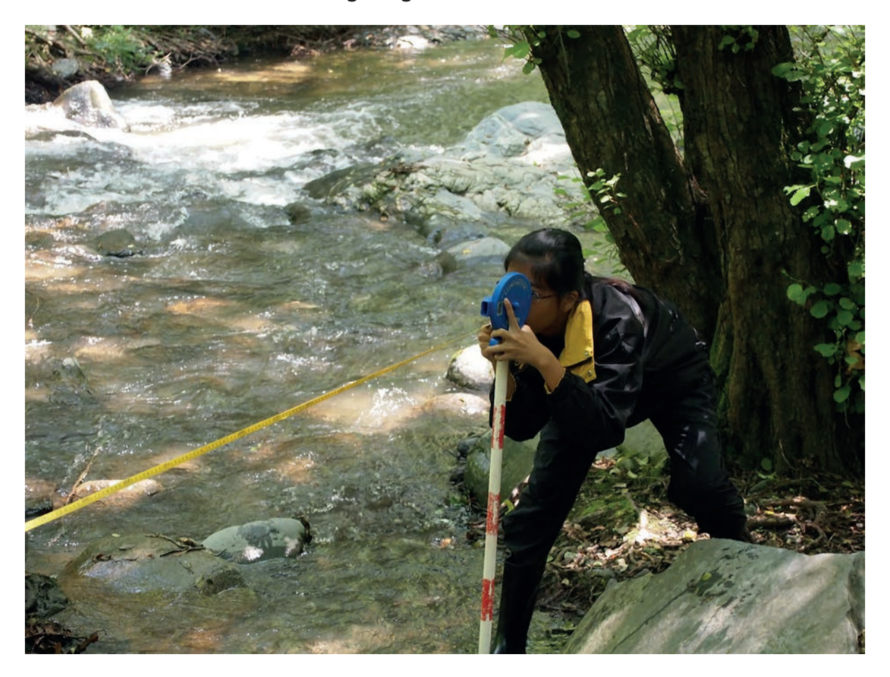
Fig. 2.2 for Question 2 Measuring the gradient of the river bed